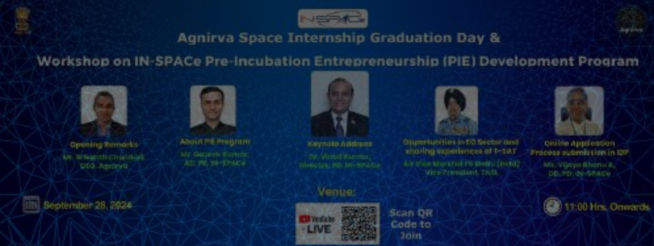
Agnirva Space Internship Graduation Day by IN-SPACE