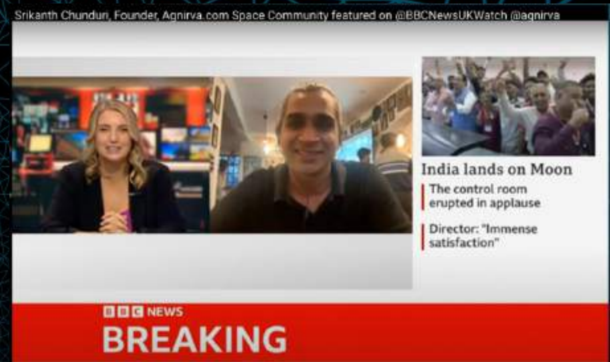
BBC UK and Reuters Feature Agnirva Chandrayaan 3 Watch Party